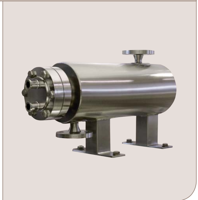
Fig. 1. Double tube sheets prevent cross contamination between the product and the heating/cooling medium.